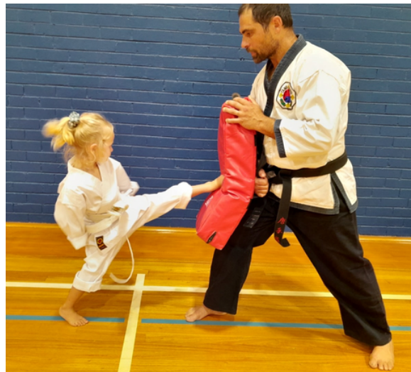
Daylesford Tang Soo Tao Martial Arts