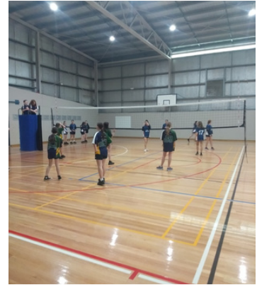
Daylesford Volley Ball Association